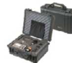
Pelican carrying case