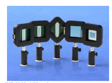
PSD Holder MH02 selection

The holder is available with SiTek's PSDs ranging from 30 - 60 mm (1D) and 20 x 20 - 45 x 45 mm<sup>2</sup> (2D). SiTek's UV-enhanced PSDs can be delivered mounted in the PSD mechanical holder upon request.