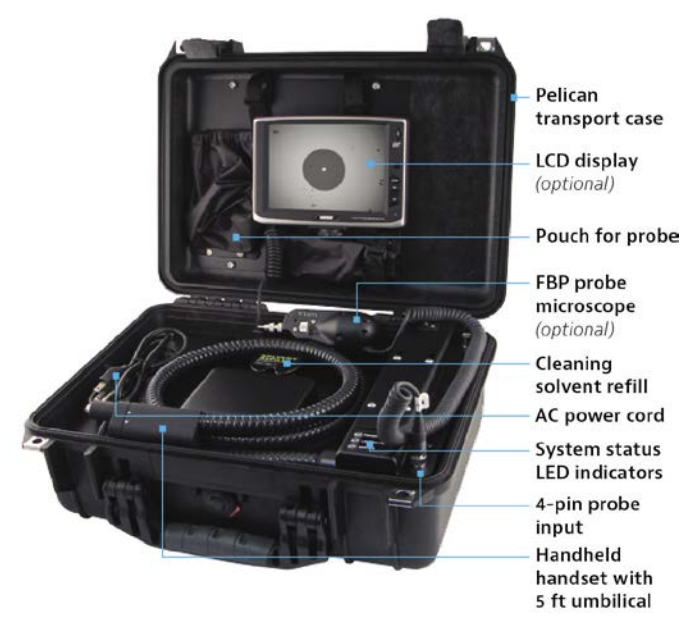
Portable CleanBlast system with FBP probe and LCD